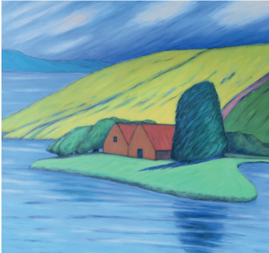
Image motif: Houses on the lake with headland / Artist: Monika Brachmann

LEIPA Square River is the shiny component of our sustainable LEIPA Square photo printing papers. The ideal choice for all decision-makers, designers and paper lovers who demand high print quality for photos and graphics and at the same time want to set an example for sustainability. Equipped with a glossy surface, River impresses with brilliant colours, sharp contrasts and a smooth surface print. Whether inside or cover: with grammages ranging from 70 to 165 g/m 2 , River offers convincing solutions for a wide variety of applications and print jobs.